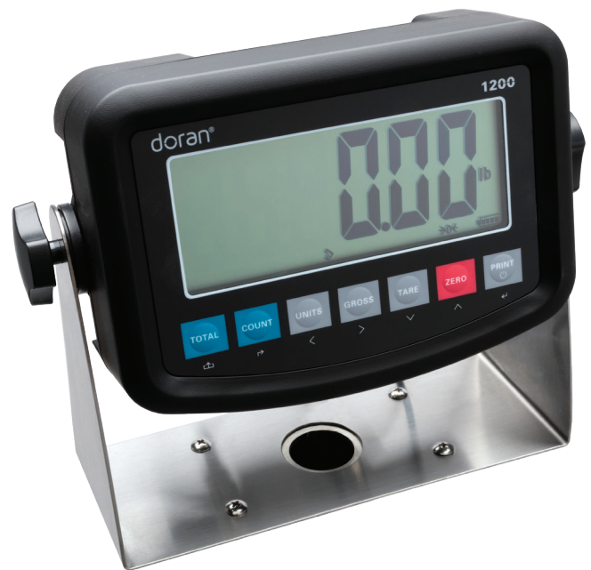
Indicator with U-Bracket

The 1200MS is battery powered and can run 100 hours on a full charge — ideal for any location or for projects that require a mobile bench scale.