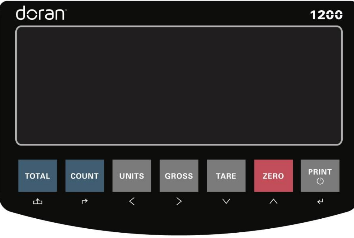
Fig. 1: Front Panel