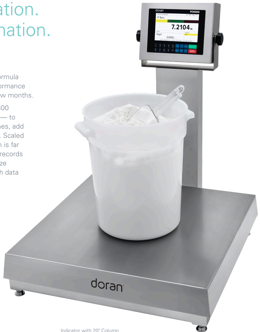
Indicator with 20" Column and DXL Series SS Scale Base.

Throughout the weighing process, the FC6300 provides real-time data for real-time control — to lower ingredients costs, eliminate bad batches, add operator accountability and find efficiencies. Scaled formulas are saved as a digital record, which is far more accurate than the typical handwritten records used on most plant floors. Search and analyze production data quickly, and retrieve all batch data of a specific lot ID.