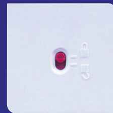
Load cell lock & adjustable footing