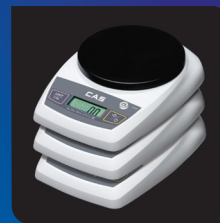
Easy to Store Stackable Design