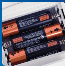
Use with 'AA' Batteries